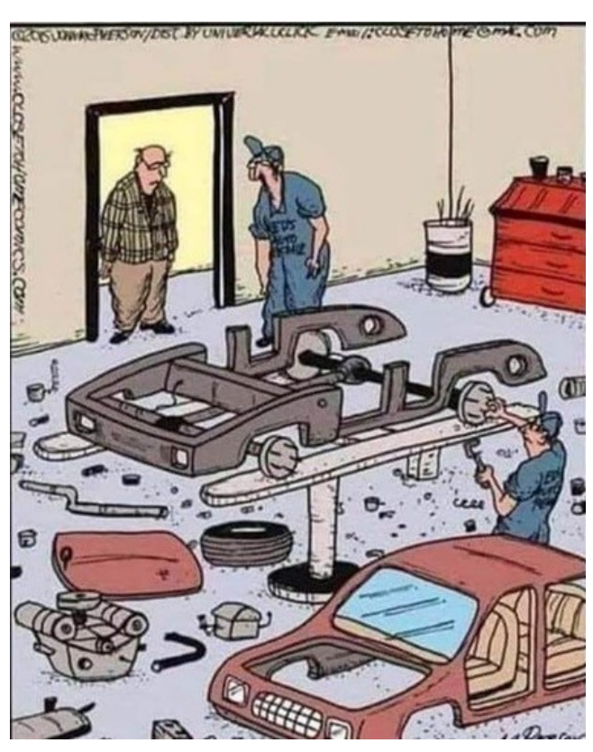
Turns out it was a marble in the ashtray..