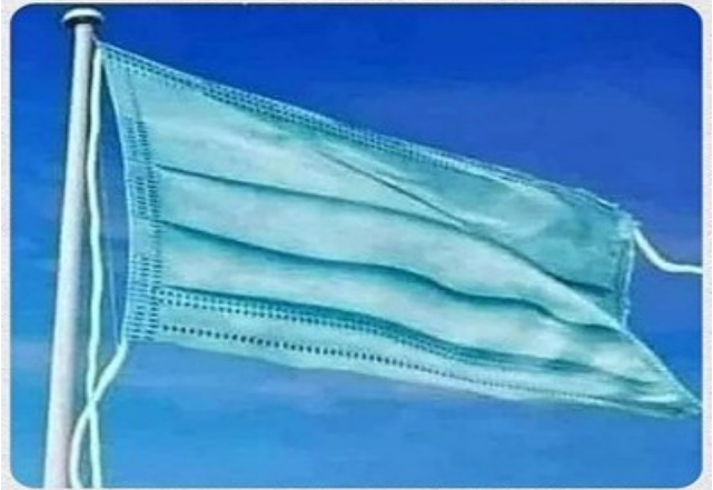
The Official flag of 2020

Be good to your spouse, Remember, right now they could poison you and it would be counted as a covid death.